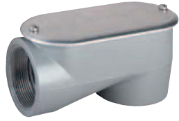
SLB-1 thru 7