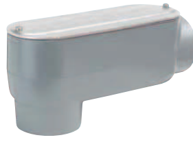
SOLB-8, 9, 0