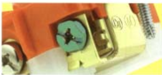
Backwire Bundling Clamp