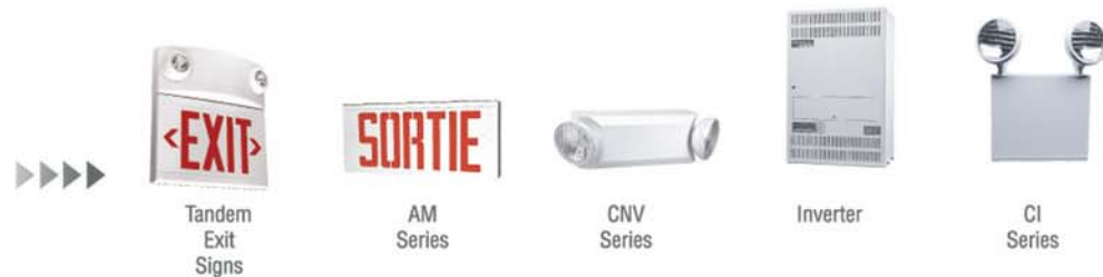
Tandem Exit Signs