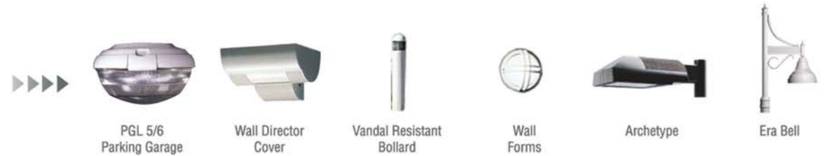
PGL 5/6 Parking Garage