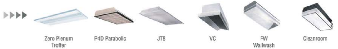
Zero Plenum Troffer