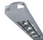
LC Aisle Light